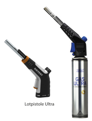
Lotpistole Ultra 2100